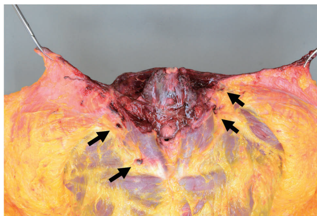
Fig 3. Subcutaneous view of the neck. Arrows indicate subcutaneous hemorrhage.

been the most popular method of suicide in the world ; however, cases of complete decapitation in suicide hanging are rare (1). 28 cases of complete decapitation in suicidal hanging have been reported in the literatures (2-21). Byard et al. reported that the incidence of decapitation in suicidal hanging was 0.2% (3/1446) in their series (20). The reported common conditions of hanging decapitation are long drop hanging, heavy body weight, and thin rope. Some reports have also mentioned a slip knot (12, 14, 21). Notably, all victims were male, which may indicate a long drop hanging as violent behavior.