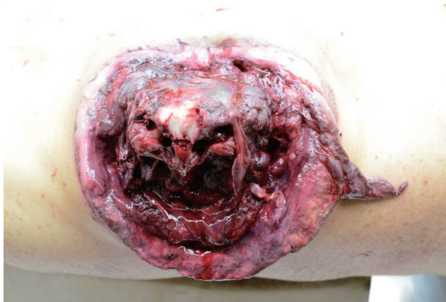
Fig 2. Superior view of the torso. Circumferential abrasion around the severance edge is visible.