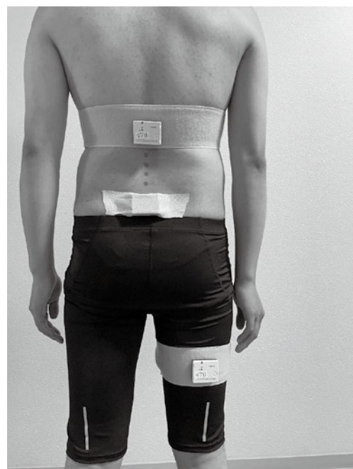
Figure 1. Location of the sensor

The participants were placed in the prone position on the bed.