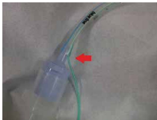
Figure 2B. Closer view of the slip joint section. Red arrow shows the slip joint section.