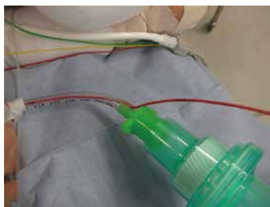
Figure 3. Magnified image of a Fogarty catheter that is inserted through a slip joint into the tracheal tube in case 2. A 4-French Fogarty catheter is inserted into an inner diameter 4.5 mm cuffed tracheal tube via the slip joint. The tip of the Fogarty catheter is guided into the left bronchus using a fiberscope that is inserted through an elbow joint removed to reduce mechanical dead space. One lung ventilation is successfully maintained with a small volume of air leakage.