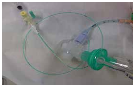
Figure 2A. Fogarty catheter inserted through the slip joint to the endotracheal tube. The Fogarty catheter is inserted into an endotracheal tube through the slip joint section. An elbow connector with a fiberscope port is inserted between the slip joint and artificial nose to facilitate the assessment of balloon position with a fiberscope. First, the slip joint is detached from the endotracheal tube. Second, a Fogarty catheter is inserted into the endotracheal tube. The slip joint is loosely connected, and mechanical ventilation reinitiated. A fiberscope is then inserted into the endotracheal tube through an elbow connector port. The Fogarty catheter is advanced into the bronchus under fiberscope guidance, and the balloon is inflated with air.

A 1-year-old girl with left pulmonary sequestration was scheduled to undergo sequestered lung removal on the left side via thoracoscopic surgery. After slow induction of general anesthesia, the patient was intubated with a single-lumen endotracheal tube with an inner diameter of 4.5 mm. We selected a 4-French Fogarty catheter for this patient, and we separated the left lung using the same procedure as described in Case 1. While first attempting to advance the Fogarty catheter to the left bronchus, the procedure failed because the Fogarty catheter contacted the right bronchus. In another attempt, we bent the Fogarty catheter chip by about 30° and twisted the Fogarty catheter to the left bronchus. Using this technique, we facilitated Fogarty catheter entry to the left bronchus. After inflating the balloon of the Fogarty catheter, OLV was successfully maintained (Figure 3). Air leakage around the Fogarty catheter was minimal enough to maintain mechanical ventilation. In this case, artificial pneumothorax was also used. However, it was somewhat difficult to maintain sufficient pneumothorax pressure due to port area leakage. However, during OLV the lung of operative side was not inflated and the lung collapse was good enough to keep surgical