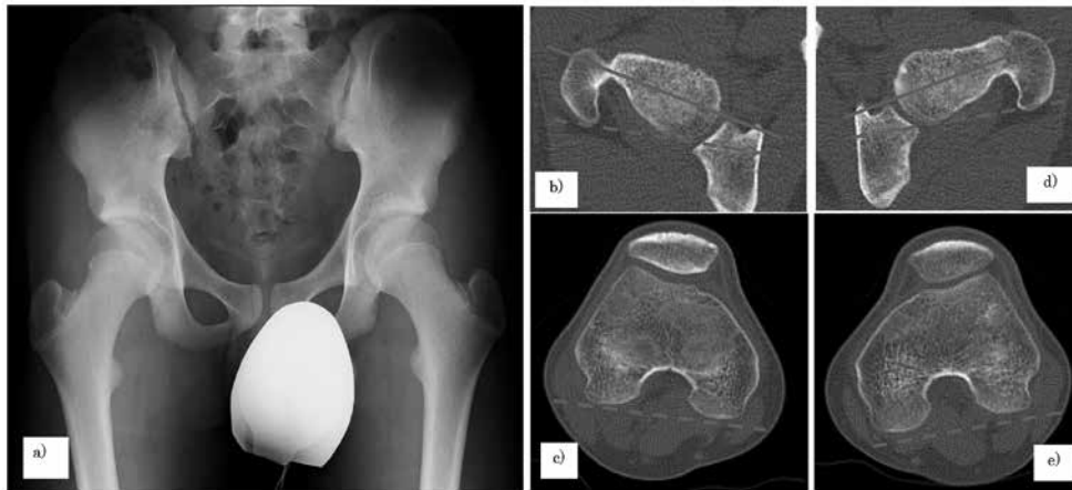
Figure 1. Preoperative findings. a) A-P view of plain radiography revealed mild dysplasia of the both hip. b) c) Computed tomography of the right femur d) e) Computed tomography of the left femur. Dotted line: posterior condylar axis. Solid line: femoral neck axis.