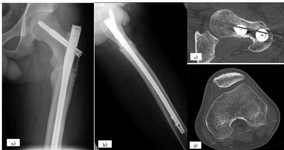
Figure 3. Findings at 12 months postoperatively. a), b) Plain radiography shows bone union at osteotomy site. c), d) CT shows 35° femoral anteversion. Dotted line, posterior condylar axis. Solid line, femoral neck axis.