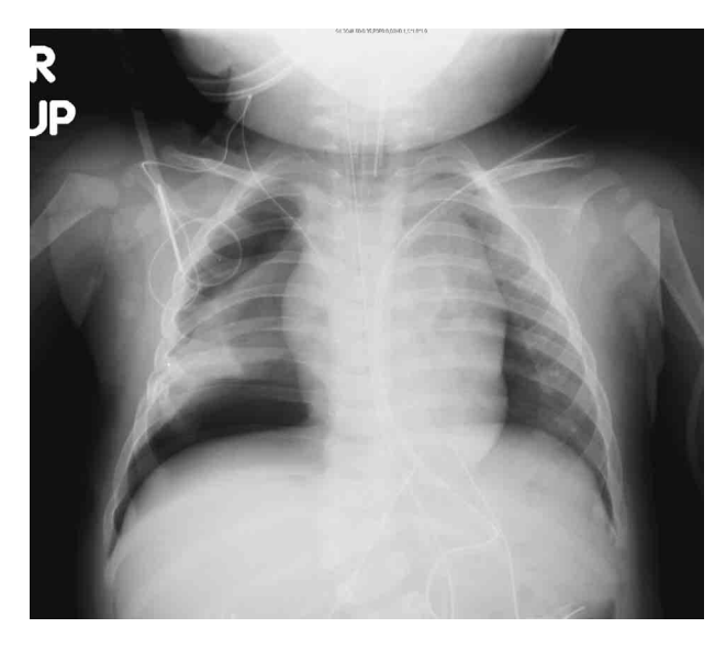
Figure 2. Chest radiograph showing a right pneumothorax.

to 100%. Manual ventilation with high inspiratory pressure and plateau pressure recovered oxygen saturation from 66% to 100%, direct blood pressure from 43/23 to 55/35 mmHg, and R-wave amplitude from 0.1 mV to 0.3 mV within 1-2 minutes (Figure 1 D). Then, the endoscopic surgery was changed to open surgery because of the difficulty of the dissection of the back of the stomach and possible pneumothorax. Hemodynamic stability was attained gradually. R-wave amplitude then recovered but did not reach the preoperative value at the end of the surgery. After the surgery was completed at 8 hours 7 minutes, a portable chest X-ray revealed a pneumothorax on the right side (Figure 2). The pneumothorax recovered after catheters were inserted into the affected area. Eventual postoperative ECG was almost same as the preoperative ECG.