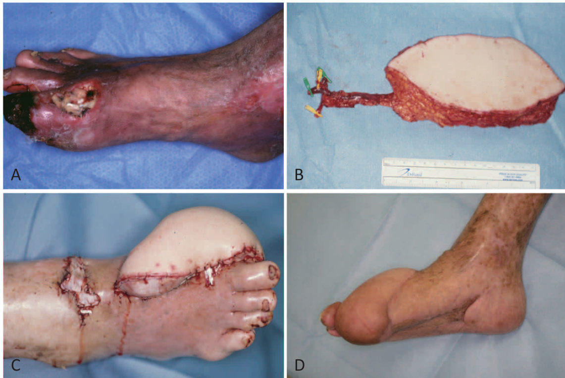
Fig. 1 : Case 3. Diabetic neuropathic foot ulcer of the right foot. A : A photograph taken during the first visit to the outpatient office. B : A free scapular flap, on which the pedicle artery and veins are identified, is harvested from the patient's back. C : A photograph taken immediately after the free flap transplantation. D : A photograph taken 10 years after the free flap transplantation.