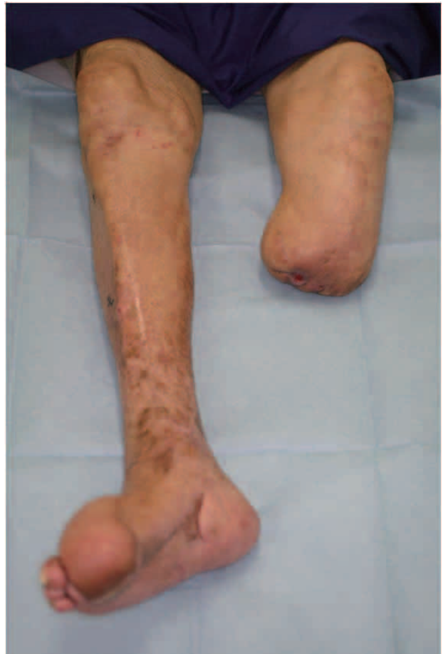
Fig. 3 : Case 3. A photograph of both legs taken 10 years after the free flap transplantation.

Case 11 : A 63-year-old man was referred to our hospital because of an incurable ulcer and fistula affecting the second, third, and fourth MTP joints of the right foot (Fig. 4). Angiography of his leg showed 80% stenosis of the popliteal artery, which was treated with the PTA procedure before the free flap surgery. In the first surgery, the infected toes and the associated MTP joints and injured skin were resected (Fig. 4A, B). After confirmation that the wound was free of bacteria, a second surgery was performed in which a free latissimus dorsi musculocutaneous flap was transplanted to the defect (Fig. 4C, 5A). One year after the free flap transplantation, the patient can walk on his foot with assistance from custom-tailored shoes (Fig. 5B, C, D).