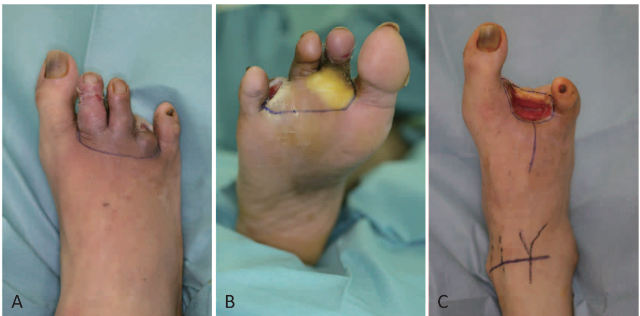
Fig. 4 : Case 11. Diabetic neuropathic ulcer of the right foot. A, B : Debridement surgery. C : The second surgery for free flap transfer.