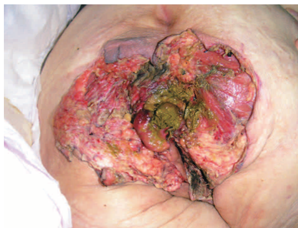
Figure 3 Anorectal and urogenital area 3rd day after operation. Necrotic tissue was completely resected.

debridement of necrosis tissue was performed immediately. Colostomy was not performed. Intraoperation and after operation, hypotension was observed and we used dopamine and norepinephrine. Bacteria was cultured from resected necrotic tissue, Peptostreptococcus Sp. and Fusobacterium Sp. were obtained. Antibiotic was used both PAMP and PIPC which had sensitivity for Peptostreptococcus Sp. and Fusobacterium Sp.. After operation wound discharge was very clear and blood pressure was kept stable. The wound at 3rd day after operation was described in Fig. 3. The 4th day after operation, disseminated intravascular coagulation (DIC) was occurred. 300 Kcal was administrated in the patient by a day. Amount of discharge from wound was about 400-600 ml per day. The concentration of serum albumin was decreased 2.6 mg/dl (preoperation) to 1.6 mg/dl (the 4th day after operation) inspite of providing 50% albumin of 50 ml for three days. Intravenous Hyperalimentation (IVH) was considered but we could not introduce IVH because sepsis was highly suspected. Oral intake was not considered because of preventing from fecal contamination. DIC was not recovered and the general status was worse gradually. At the 10th day after operation, she was died.