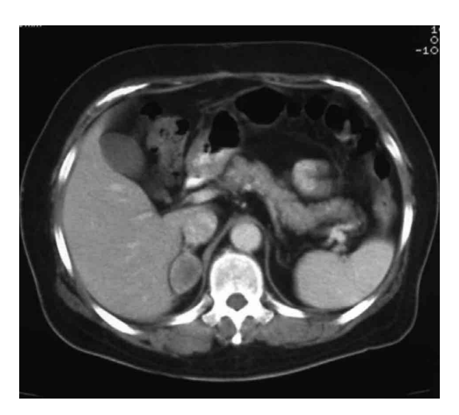
Fig. 1: Surveillance computed tomography performed 14 months postoperatively, revealing a right adrenal tumor, 30 mm in diameter

patient underwent total abdominal hysterectomy with bilateral salpingo- oophorectomy and pelvic lymph node dissection. Histopathological examination revealed well-differentiated endometrial carcinoma with depth of myometraial invasion in the inner one-half, with no invasion of the cervix or adnexa. The cytological diagnosis of ascitis in the pelvic cavity was negative, but she had pelvic node involvement. We diagnosed stage IIIc. The patient then received 7 courses of adjuvant chemotherapy with carboplatin and paclitaxel. However, surveillance computed tomography (CT) performed 14 months postoperatively revealed a suspicious right adrenal tumor, 30 mm in diameter (Fig. 1), which