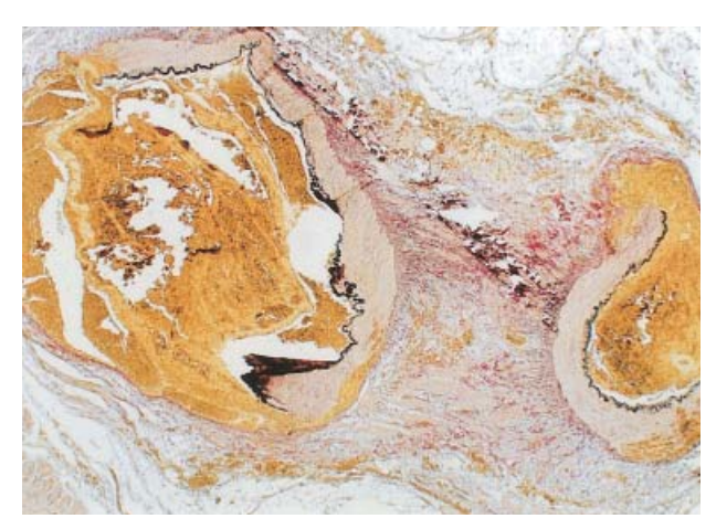
Fig 4 Dissection of the left ovarian artery in the outer layer of its media and direct communication between the native lumen and the dissecting cavity of the artery. (EvG stain, 1×)

Histological findings: The left ovarian artery and its branches, and several veins were detected histologically in the hematoma in the fibrofatty tissue. The artery was winding and tortuous, and dissection of the outer layer of the media of arterial wall was observed. Direct contact between the dissecting cavity filled with blood coagula and the native lumen of the artery existed. The dissection reached the wall of branches of the artery. Entry and re-entry sites of the arterial dissection were not clear. The dissection of the arterial wall was nearly circumferential in some parts and the native lumen of the artery and dissecting cavity formed double tubes of blood (Fig 4). The site of rupture was recognized (Fig 5). The veins were winding and had the plexus formation.