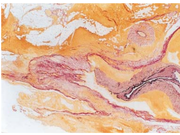
Fig 5 Site of rupture of the wall of the left ovarian artery. (EvG stain, 1 ×)