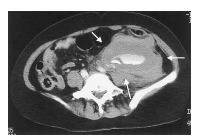
Fig 2 Dynamic abdominal CT showed an outflow of medium from a blood vessel in the hematoma