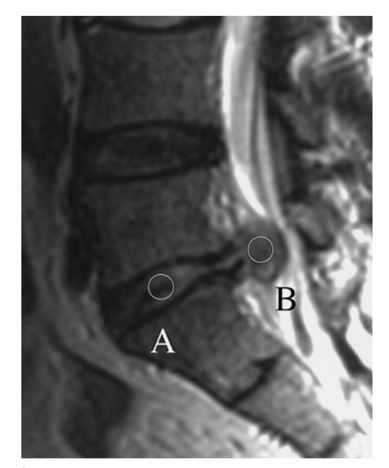
Fig. 1 Establishment of the region of interest (ROI) in the herniated nucleus pulposus and nucleus pulposus where herniation occurred.

On the T2-weighted sagittal MR image, we established regions of interest (ROI) in the center of the HNP and in the center of nucleus from which it extruded (original nucleus), (Figure 1). Signal intensity of the ROI was measured, and the ratio of the signal intensity (SIR; Signal Intensity Ratio) in the herniated mass to that of the original nucleus was calculated. In this study, we attempted